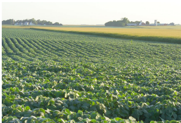
More than one-fifth of the calories grown in farm fields are

"Global food commodities trade is worth more than US$520 billion per year, could feed approximately two billion people, uses about 13% of worldwide cropland and pasture, and has geographically